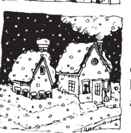
ensure that your house looks lived in at all times?